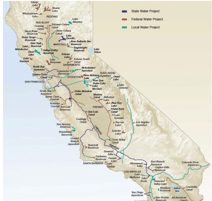
Figure 1. Extracted from California Water Commission, 6/21/17 Meeting.

As water supplies are carefully regulated, so is water quality, which is important for meeting drinking water standards. The Irrigated Lands Regulatory Program has been tackling both surface and groundwater impacts by agriculture. The CV-SALTS program is just starting to take effect and is focused on nitrates and salts from all sources in the Central Valley. Significant research by the almond community has been focused on how to best apply nitrogen fertilizers and limit any potential impacts to both surface and groundwater.